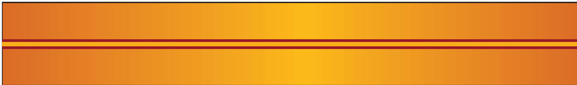
Right Extension for Crown