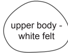
upper body - white felt