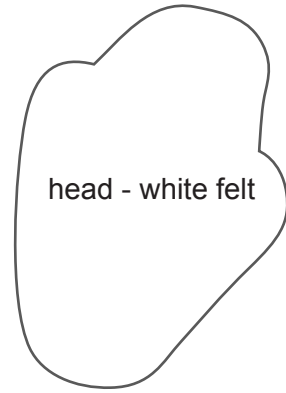
head - white felt