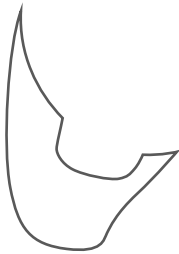
smile - dark grey felt