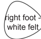
right foot - white felt