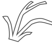
stick hair - brown felt