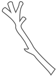
left arm - brown felt